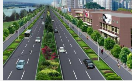
Along the Highway