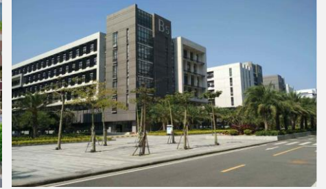
Campus Scenic Spot