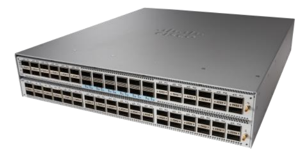
Figure 3. Cisco 8202

The Cisco 8200 Series design yields unprecedented power efficiency. To achieve equivalent routed bandwidth and scale, other routers require multiple devices such as off-chip Ternary Content-Addressable Memory (TCAMs) and fabric ASICs.