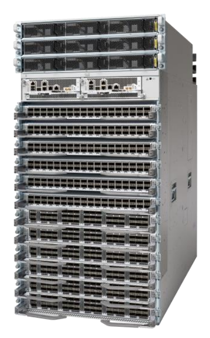
Figure 4. Cisco 8812