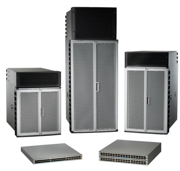
Figure 1. Cisco 8201, 8202, 8808, 8812, and 8818

High-performance networking systems have historically been divided into routing or switching classes, with distinct hardware and software. Over time, this distinction has become less pronounced. This convergence has occurred with the evolution of feature-rich switching chips and routing chips that balance traditional Service Provider (SP)-class capabilities with many benefits of switching Application-Specific Integrated Circuits (ASICs).