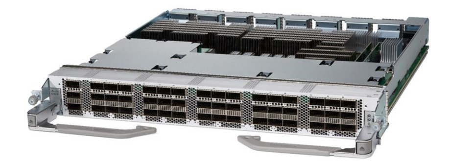
Figure 6. 48-port QSFP28 100 GbE line card