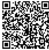
CloudLink Collaborative Telepresence Products

Copyright © Huawei Technologies Co., Ltd. 2020. All rights reserved.