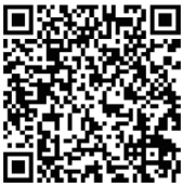
Huawei Video Conferencing Solution