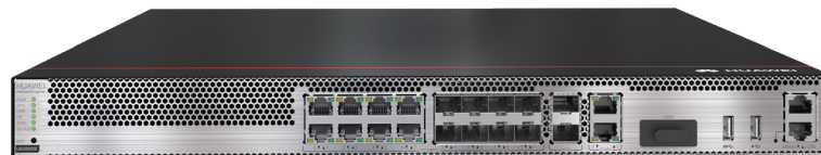
HiSecEngine USG6500E Series (Fixed-Configuration)