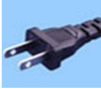
North America C13-C13