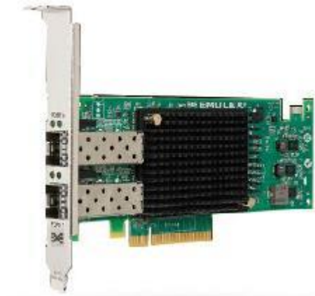
EMULEX FCoE-SFP+ 2 ports(with

2) Manually add extra P4 GPU cards (BOM:06320107) after choosing riser cards on the configurator.