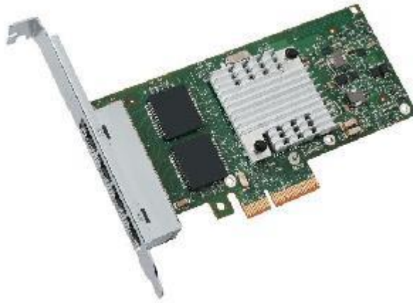
Electrical Interface NIC