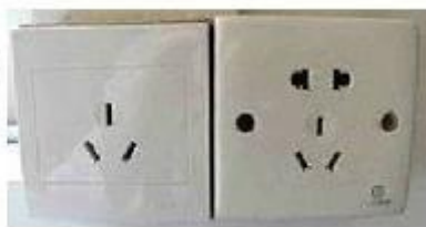
Normal wall plug