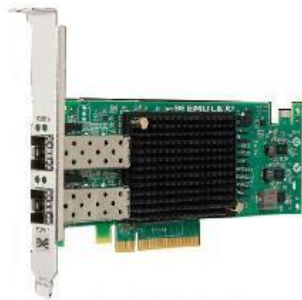
EMULEX FCoE-SFP+ 2 ports (with