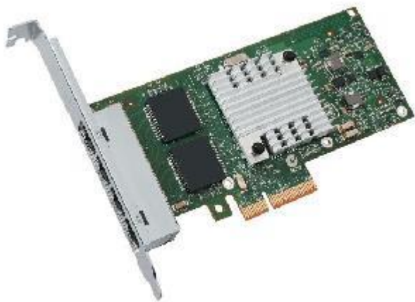
Electrical Interface NIC