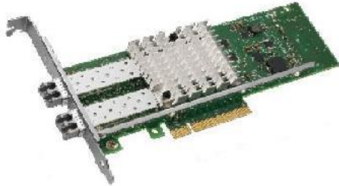
Optical Interface NIC(with Optical Transceiver)