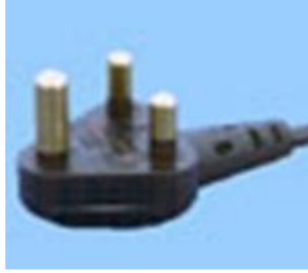
South Africa C13-C13