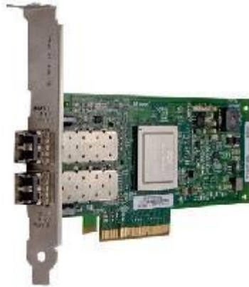
Qlogic Dual-port 8G HBA (with Optical