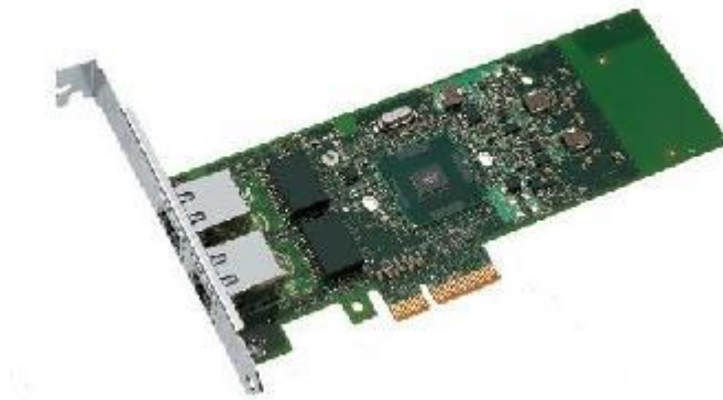
RJ45 Electrical Interface NIC