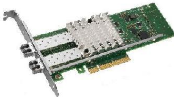
INTEL 2*10GE Optical Interface NIC(with Optical Transceiver)