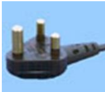
South Africa C13-C13