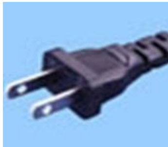
North America C13-C13