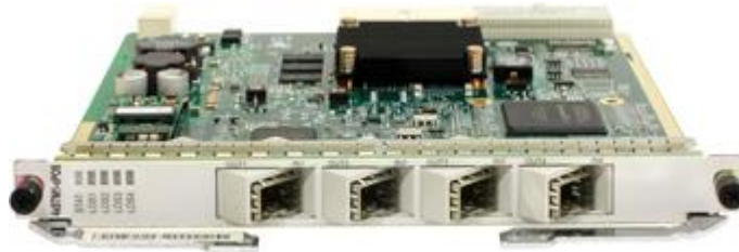
4-Port Channelized STM-1c POS-SFP Physical Interface Card(PIC)

Need configure 155M SFP/eSFP Optical Transceiver.