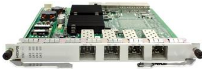
4-Port OC-3c/STM-1c POS-SFP Physical Interface Card

Need configure 155M SFP/eSFP Optical Transceiver.