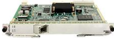
1-Port Channelized STM-1c POS-SFP Physical Interface Card

Need configure 155M SFP/eSFP Optical Transceiver.