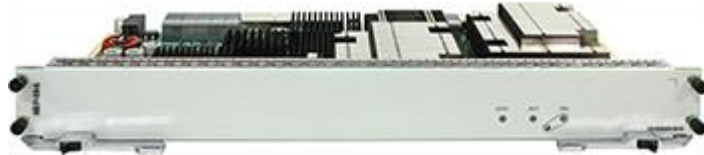
Processor (NSP-50-E, Apply for - 40~ 65degree scene)