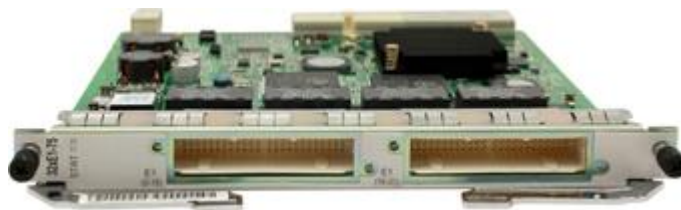
32-Port E1 Physical