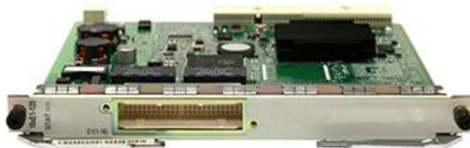
16-Port E1 Physical