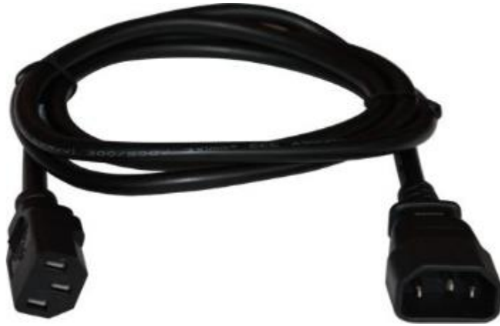
PDU Cable C13-