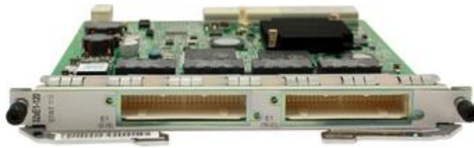
32-Port E1 Physical