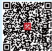
Huawei Enterprise Support

Copyright © Huawei Technologies Co.,Ltd. 2018. All rights reserved.