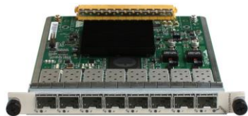
8-Port 100/1000Base-X-SFP Flexible Card A(P10-A, Supporting 1588v2)