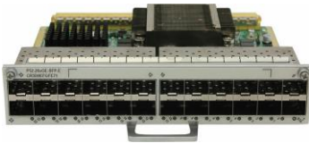
24-Port 1000Base-X-SFP Flexible Card E(P52-E)