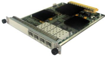
4-Port OC-48c/STM-16c POS-SFP Flexible Card