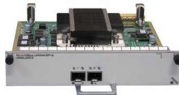
2-Port 10GBase LAN/WAN-SFP+ Flexible Card E(P52-E)