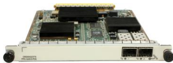
2-Port OC-3c/STM-1c POS-SFP Flexible Card