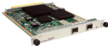
2-Port 10GBase WAN/LAN-SFP+ Flexible Card A