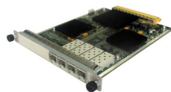
4-Port OC-3c/STM-1c POS-SFP Flexible Card