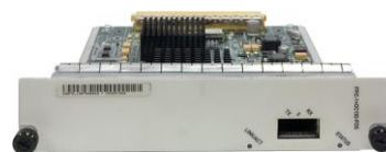
1-Port OC-192c/STM-64c POS-XFP Flexible Card(Occupy two slots)