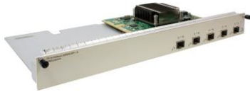
5-Port 10GBase LAN/WAN-SFP+ Flexible Card A(P51-A, Occupy two sub-slots)