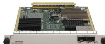
2-Port Channelized STM-1c POS-SFP Flexible Card(P50)