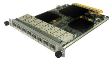
8-Port OC-3c/STM-1c POS-SFP Flexible Card