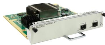
2-Port 10GBase LAN/WAN-SFP+ Flexible Card A(P51-A)