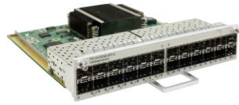
24-Port 100/1000Base-X-SFP Flexible Card A(P51-A)