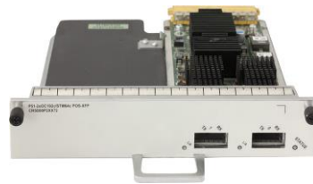
2-Port OC-192c/STM-64c POS-XFP Flexible Card(P51-A)