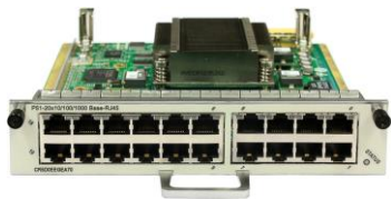
20-Port 10/100/1000Base-RJ45 Flexible Card A(P51-A)