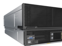
Half-width heterogeneous compute node