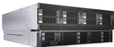
Full-width heterogeneous compute node

Huawei FusionServer G5500 adopts a fully modular, heterogeneous, decoupled system design. It provides full-width and half-width heterogeneous compute nodes and supports heterogeneous accelerator cards of various types such as PCIe GPU, SXM2 GPU, and PCIe FPGA. Featuring high-density heterogeneous computing, the server offers various heterogeneous topology configuration options and one-click topology switching, and supports long-term evolution of CPU and heterogeneous computing technologies. The FusionServer G5500 is suitable for acceleration of applications such as AI, HPC, intelligent cloud, video analytics, and database, making it an ideal heterogeneous computing platform for large-scale data center deployment.